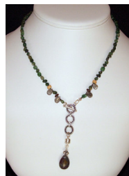
Four Loop Toggle