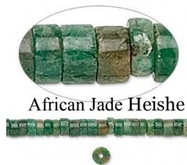
African Jade Heishe