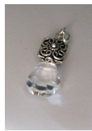
Quartz and Sterling