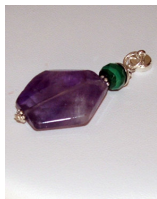
Amethyst and Malachite

Inspired pendants are created using a variety of gemstones, glass beads, pearls, and metal beads and include the signature magnetic end to attach to necklaces in the Inspired Collection.