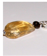
Citrine and Black Agate