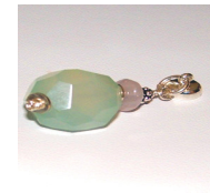
Chalcedony and Rose Quartz